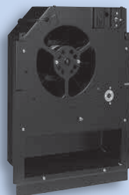
Heater Assembly with Thermostat and Fan Switch